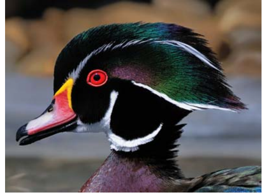
Bert Schmitz "Wood Duck Portrait" HM 25 pts