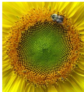
Jane Rossman "Sunflower with bee" 8 pts