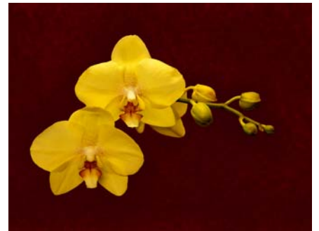
Gisele Doyle "Yellow Orchids" 11 pts