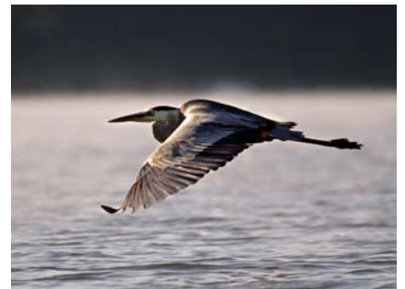
Brian Wilcox "Blue Heron" 9 pts