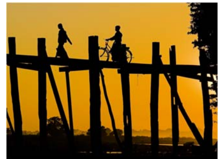
Bert Schmitz "Footbridge at Sunset" 11 pts