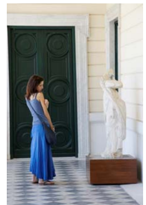
William DeVoti "Perdita in a Blue Dress" 9 pts