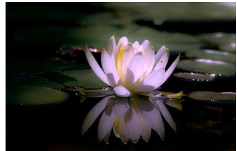
Lazlo Gyorsok "Waterlily" 20 pts