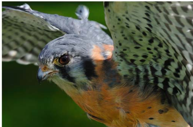
Bert Schmitz "American Kestrel" Nature Competition — Best Of Show

The first Projected Image Competition with only digital images being judged was held in 2010. There were 279 entries with 147 in Open and 132 in Nature.